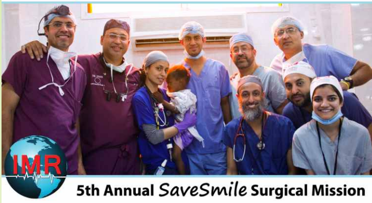
5th Annual SaveSmile Surgical Mission