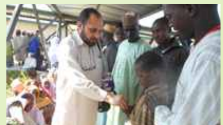
The participating eye surgeons were presented with certificates of participation.