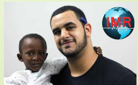
The smile is back.....