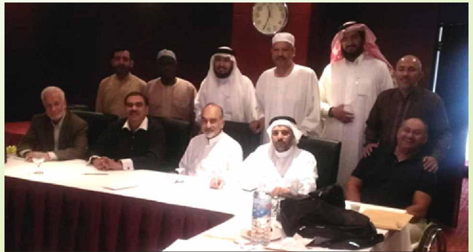
Day 1 of the FIMA semi-annual EXCO meeting