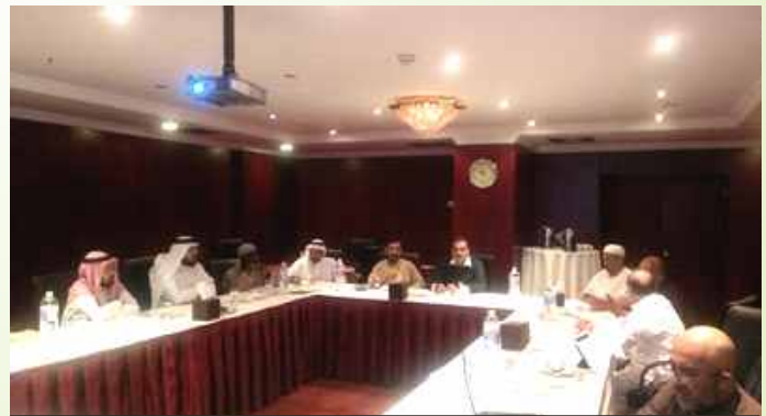
FIMA EXCO meeting (inaugural session)