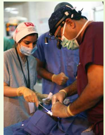
Day 3 AND 4 OF THE Save Smile camp, the target of 500 achieved on day 4 th of the camp.