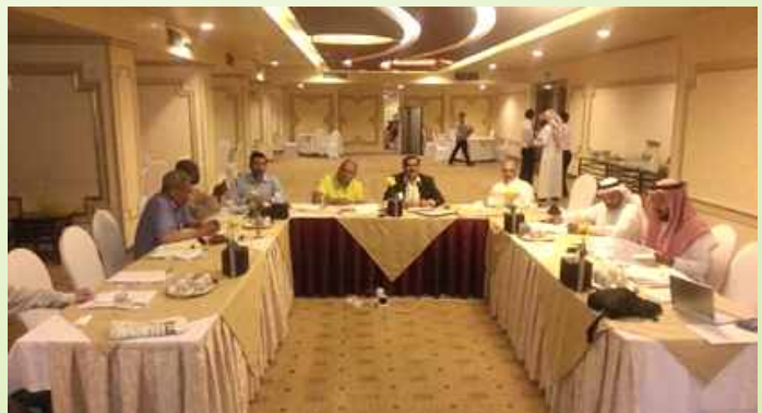
Concluding session of the EXCO meeting in Hotel al Shuhada.