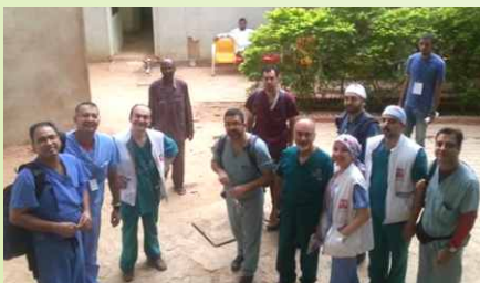
Day 2, the surgeons getting ready to move to the hospital.

The team focused on setting up and coordinating logistics for the